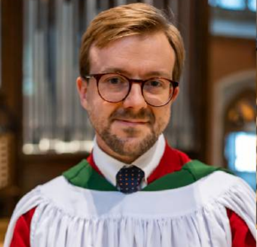
DIRECTOR OF MUSIC