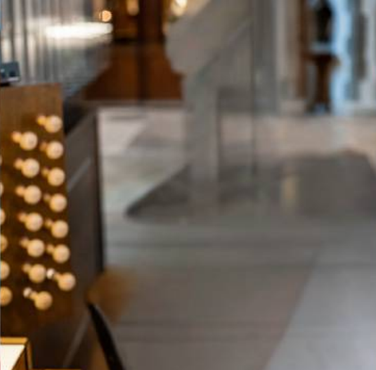
ASSISTANT DIRECTOR OF MUSIC