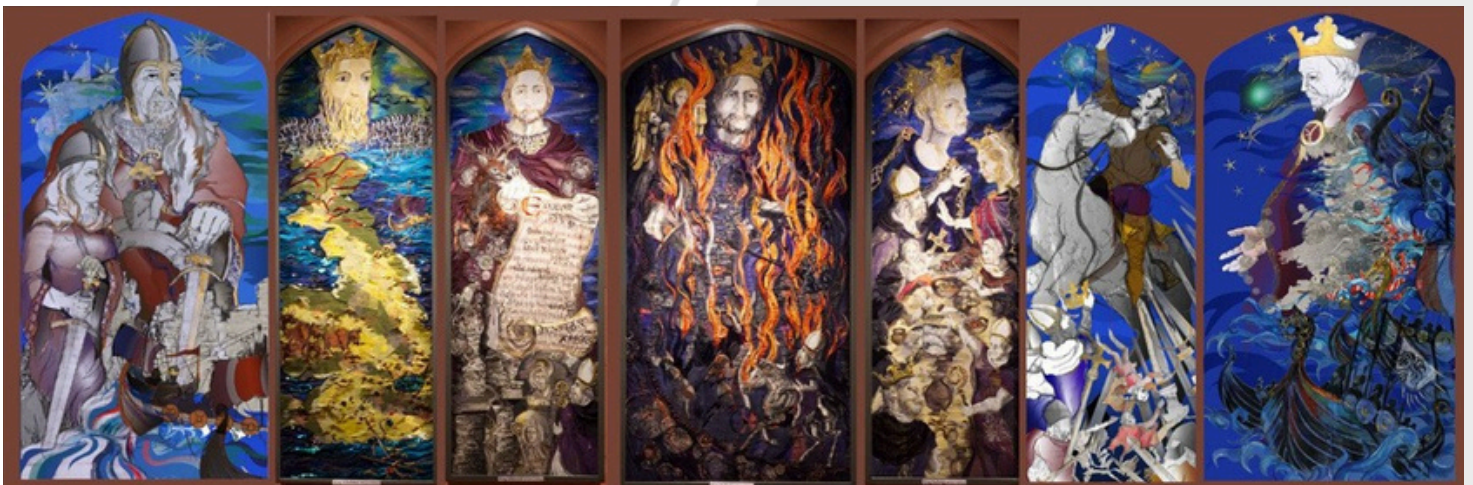
Representation of how the completed panels will appear once complete

For more information and to contribute to this iconic project please visit: www.allsaintskingston.co.uk/heritage/seven-saxon-kings